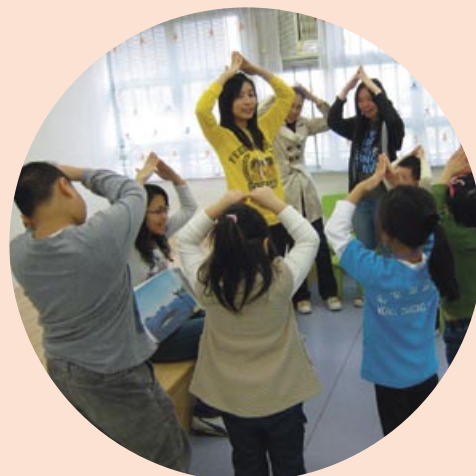
◉ Playing game is a good activity in helping the kids to learn more from the story.