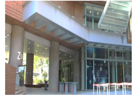
2: TU 201